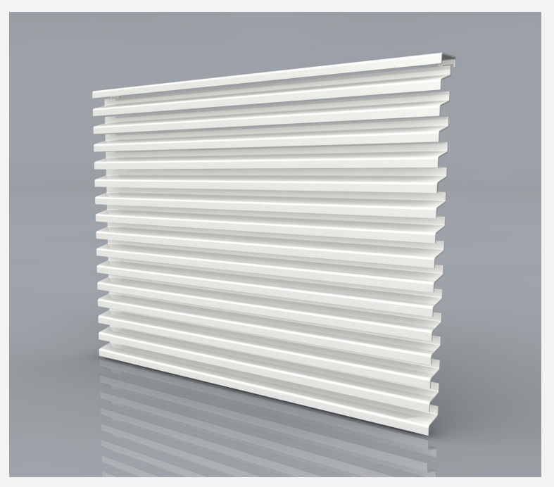
pictured: aluminum louver

FlowGrill louvers are developed for extreme circumstances and available in different designs, many functional executions and additional options.