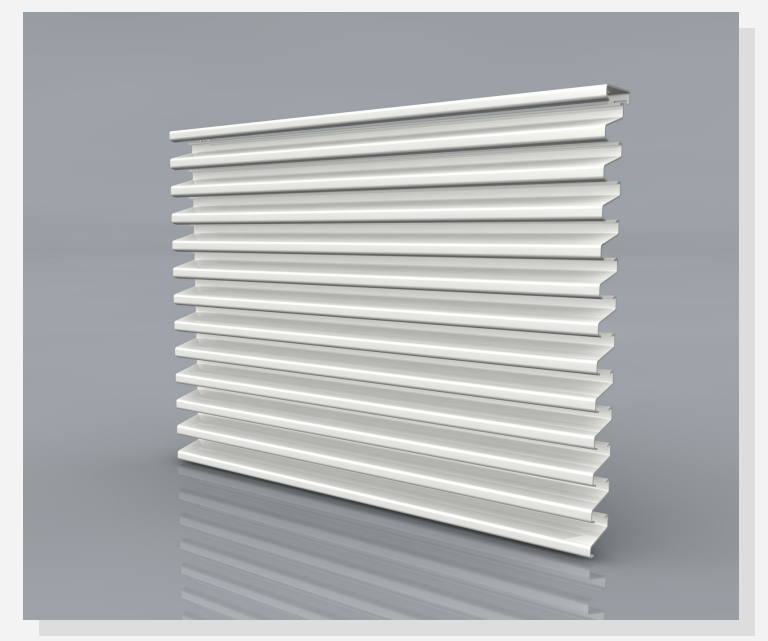
pictured: aluminum louver

FlowGrill louvers are developed for extreme circumstances and available in different designs, many functional executions and additional options.