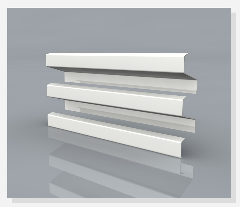
pictured: aluminum louver

FlowGrill louvers are developed for extreme circumstances and available in different designs, many functional executions and additional options.