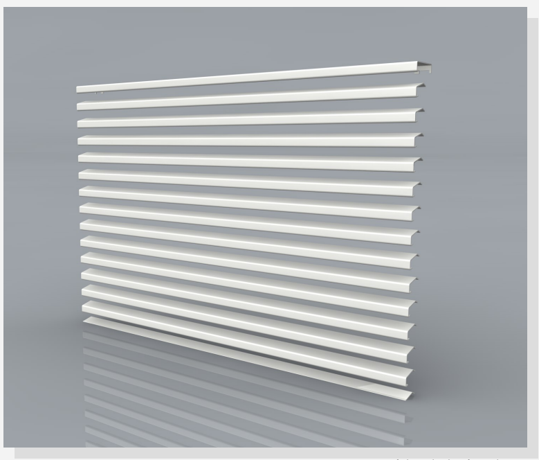
pictured: aluminum louver

FlowGrill louvers are developed for extreme circumstances and available in different designs, many functional executions and additional options.